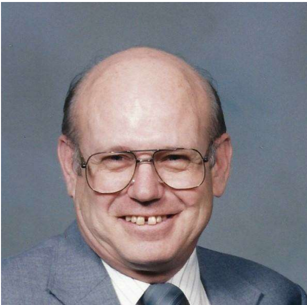
Photo taken for the church directory while living in Florida